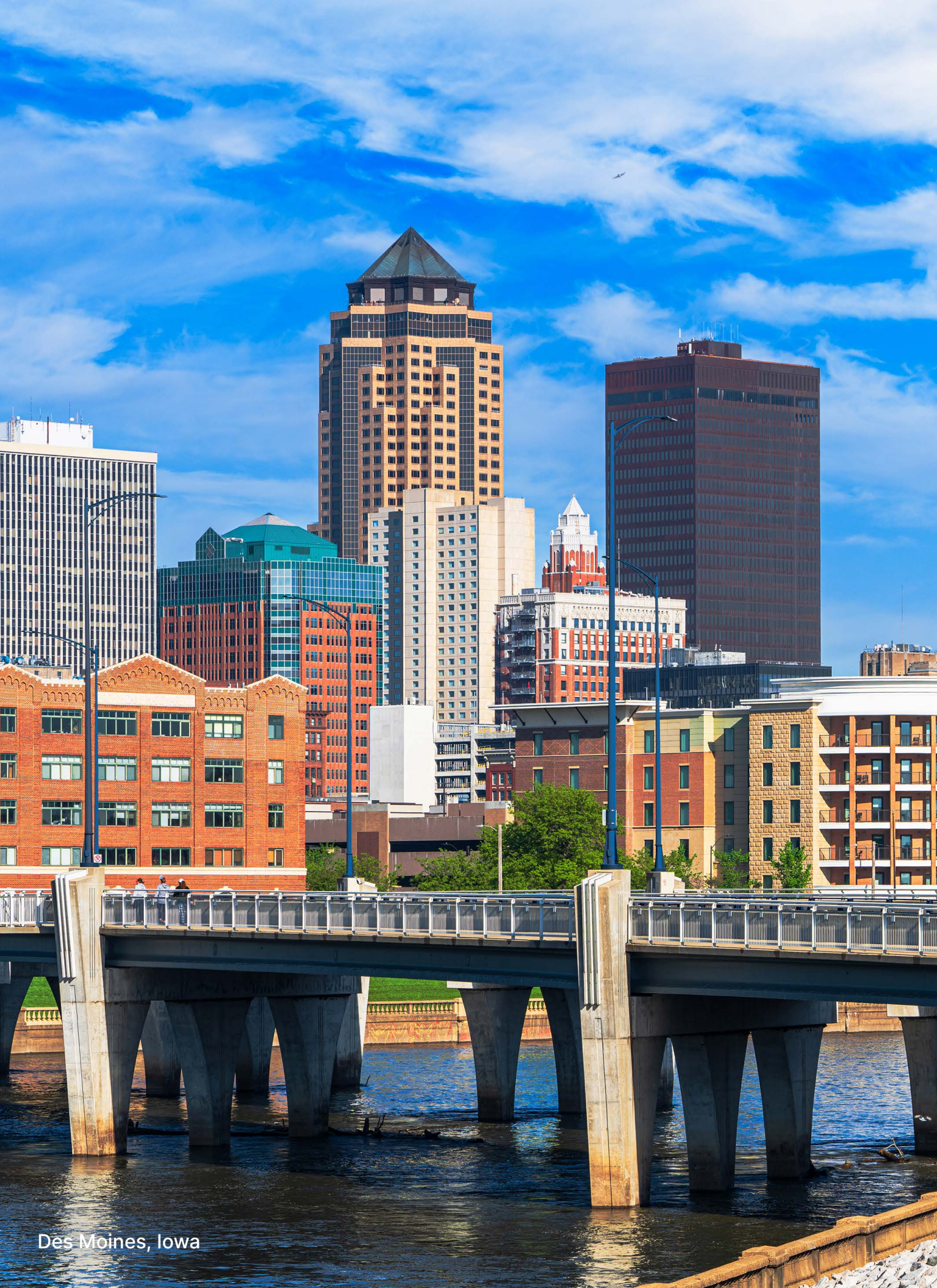
Des Moines, Iowa