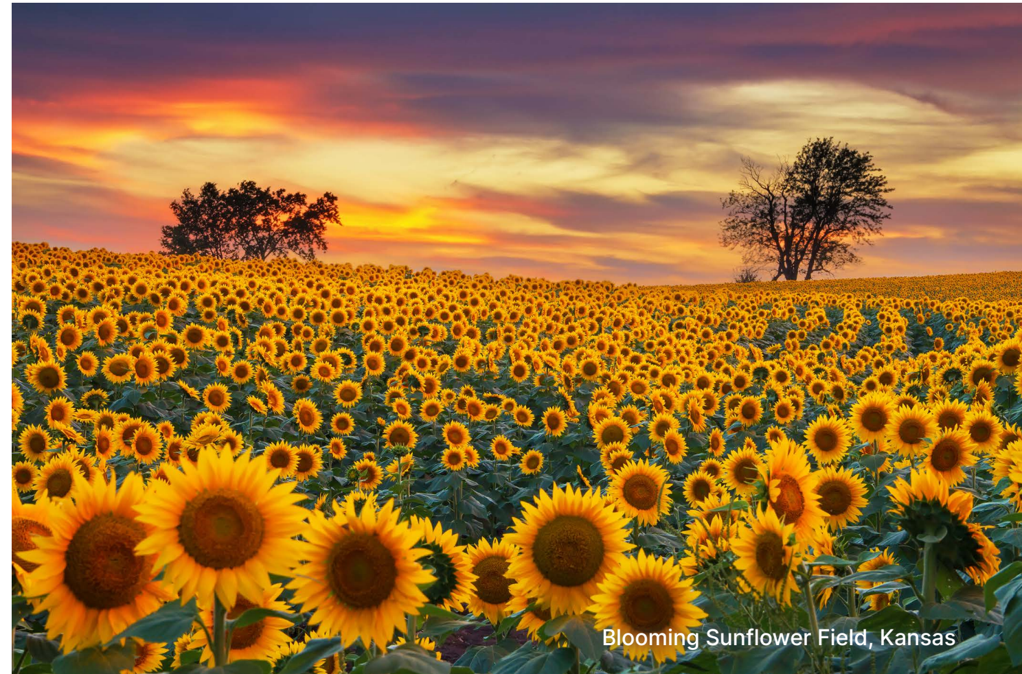
Blooming Sunflower Field, Kansas